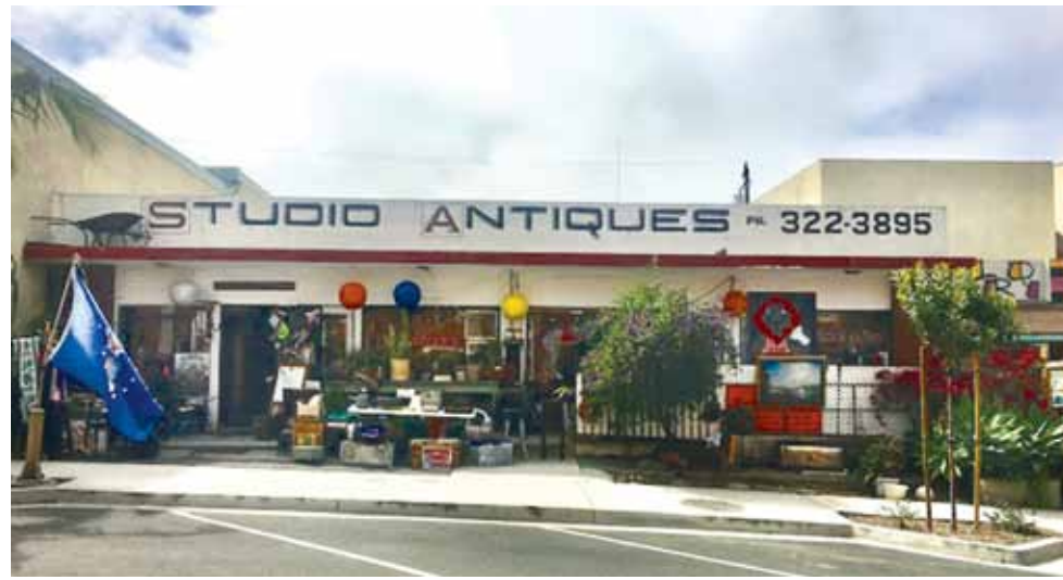
Studio Antiques can be found at 337 Richmond Street, near Main Street.