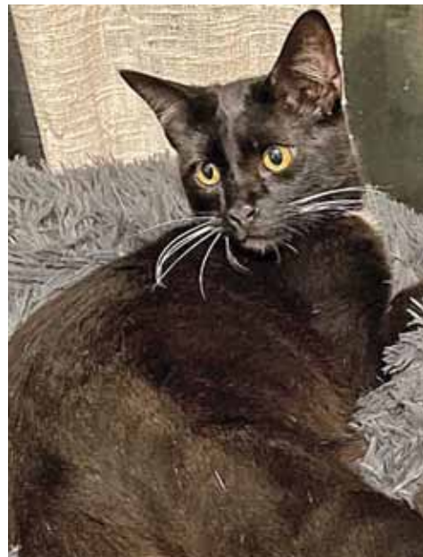
Billy the Kit

Shiegra and Nook Nook are two sisters named after magical creatures from a Christmas story by L. Frank Baum (OZ). Shiegra is a lioness, brave, beautiful, and attentive. Nook Nook is a sweet, silly sprite that is playful, mischievous, and mysterious like all fairy folk. Shiegra is the more confident of the two sisters. She'll jump all over you, preparing for a sneak attack on Nook Nook