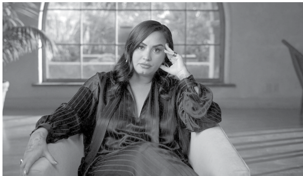
Dancing With the Devil , courtesy of YouTube Originals.