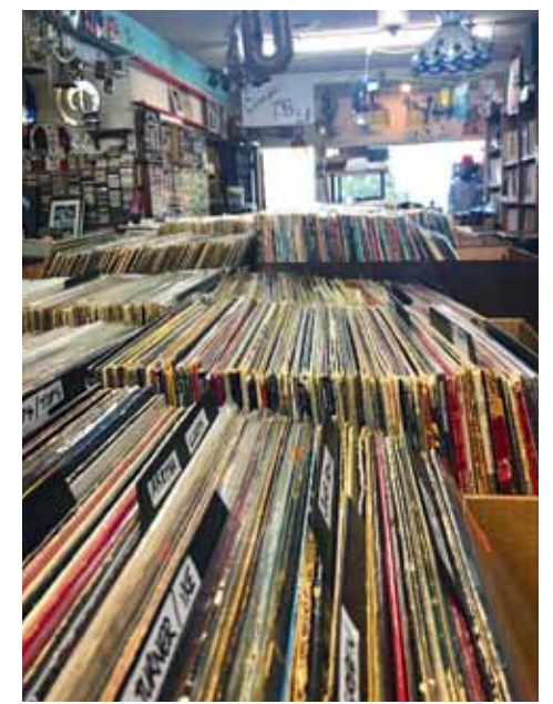
The Martins say they have over 20,000 vinyls for sale in their shop.

Currently, they run their show called “Around the Bend” on YouTube, interviewing interesting subjects and talking about antiques. In the back of their shop, they have what they affectionately call the Ghost Town. It’s a series of sheds constructed from reclaimed wood that used to comprise an 1860s cabin in Big Bear. As things open back up, they are looking to the future and hoping to hold small concert events with their vinyls in the Ghost Town to bring the community together and talk about old things with new friends. •