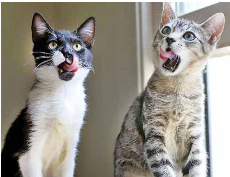
Shiegra and Nook-Nook

When you adopt a "pet without a partner", you will forever make a difference in their life and they are sure to make a difference in yours. •